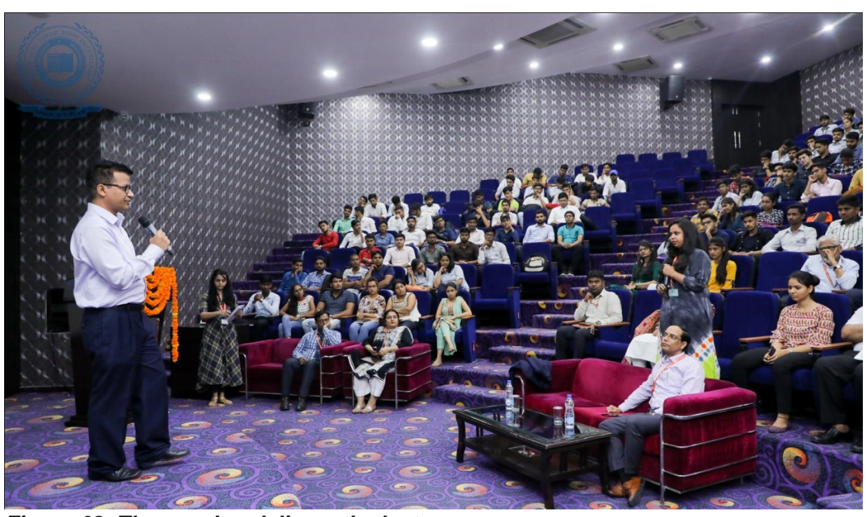
Figure:02 The speaker delivers the lecture

SHREE GURU GOBIND SINGH TRICENTENARY UNIVERSITY (UGC Approved) Gurugram, Delhi-NCR