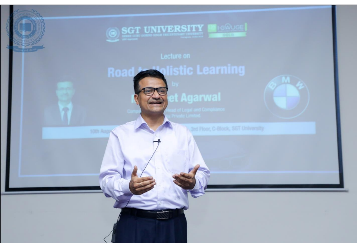
Figure:01 The speaker addresses the gathering